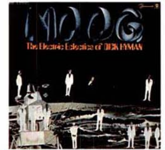
Moog—The Electric Eclectics of Dick Hyman (938-S).