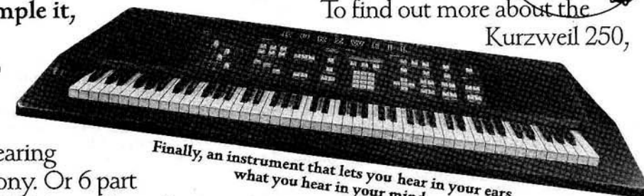
Finally, an instrument that lets you hear in your ears what you hear in your mind.

To find out more about the Kurzweil 250,