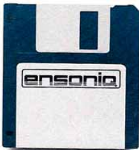
Ensoniq will provide a library of diskettes with 3 different digitally recorded sounds on each.

The sound source of the Mirage is a 3 1/2" floppy disk in a protective plastic cassette. Each one is programmed by Ensoniq with 3 digitally recorded sounds, so you can build up a library of truly authentic sounds to play with.