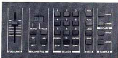
The keypad lets you customize sounds by just pushing a button.

The Mirage is an 8-note polyphonic keyboard, so you can play